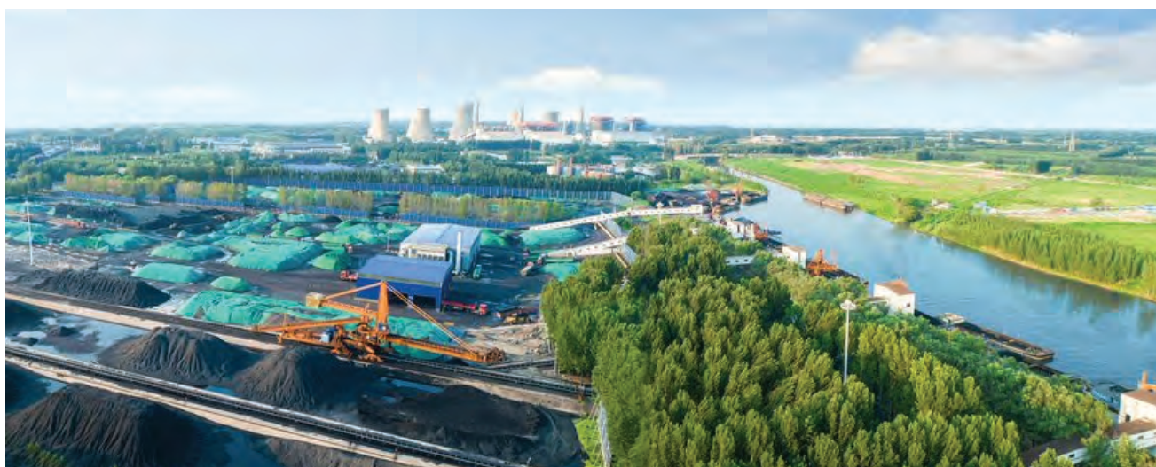
Jining Sime Darby Port